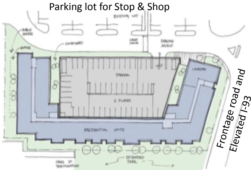
Multi family neighborhood