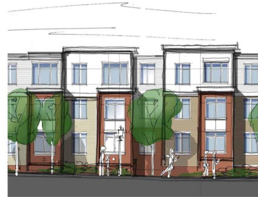
New Design Concept